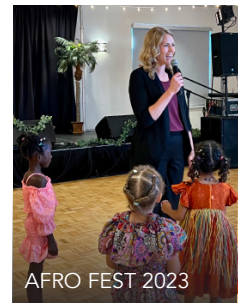
AFRO FEST 2023