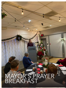
MAYOR'S PRAYER BREAKFAST