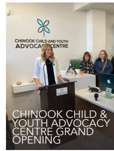
CHINOOK CHILD & YOUTH ADVOCACY CENTRE GRAND OPENING