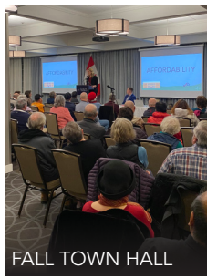
FALL TOWN HALL