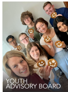
YOUTH ADVISORY BOARD