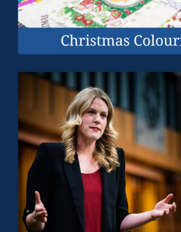
Speaking in the House