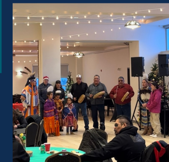
Southern Alberta Ethnic Association Christmas Dinner