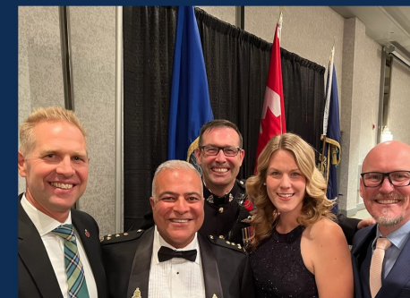
Lethbridge Police Ball