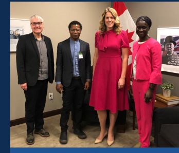
Federation of Francophone and Acadian Communities of Canada