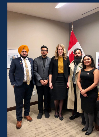
Canadian Alliance of Student Associations