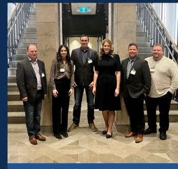
National Cattle Feeders' Association