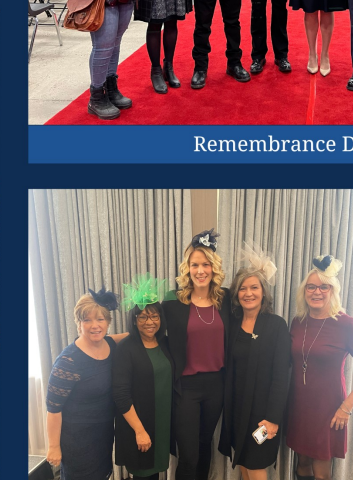
Streets Alive Mission