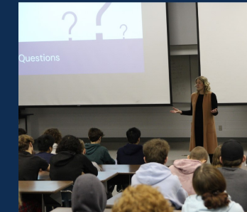
School Visit to LCI