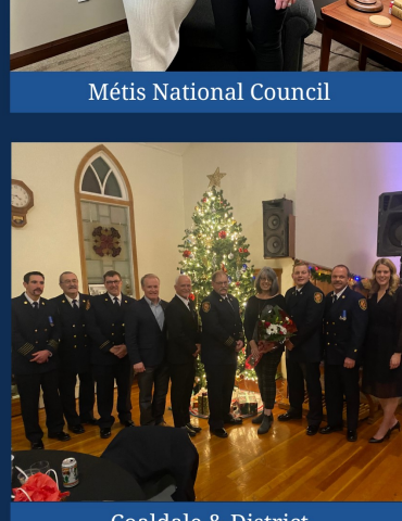
Coaldale & District Emergency Services Banquet