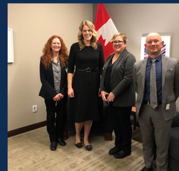
Association of Canadian Publishers